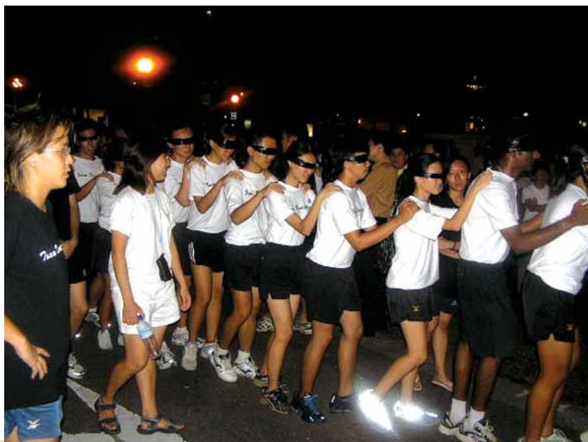
All Nite Long – Blind Human Chain