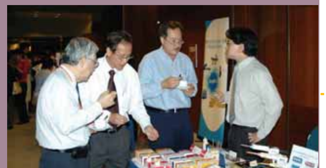
Participants exploring the Trade Exhibitions