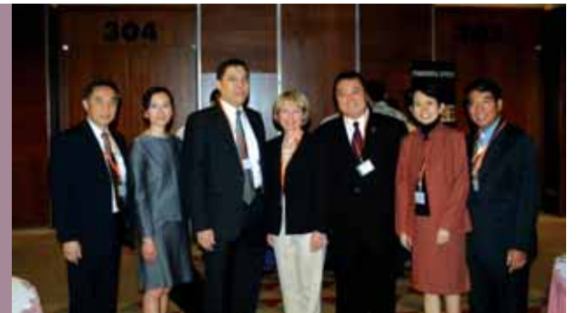
Organising Committee and Dean with the two speakers

The Faculty would like to thank all the participants, sponsors, committee members and helpers who contributed to make this event a success!