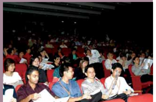
Over 300 participants registered for the lectures at Suntec Theatre