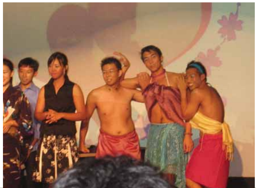
Sexy "chicks" on the dance floor