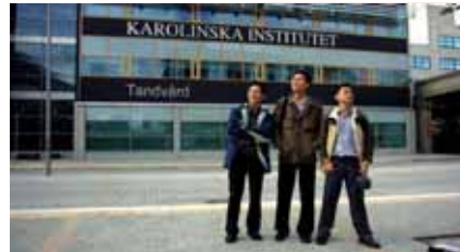
Front façade of the University