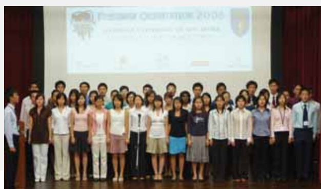
Presenting all of the 42 freshmen in the Class of 2010

Finally, the freshmen also took part in the NUS Trifac Bash 2006 which is an annual event held in conjunction with the Department of Pharmacy and Yong Loo Lin School of Medicine. Our team put up an awesome dance performance that combined elegant ballroom dancing with funky hip hop moves. We sure did rock Gotham Penthouse that night!