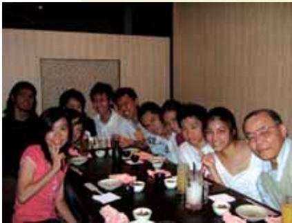
Traditional Japanese dinner with our hosts

We greatly enjoyed our visit to Tokyo Medical and Dental University. The Japanese hosts were very hospitable and brought us around the faculty. We were impressed with the advanced technology utilized within the faculty. The professors were also very keen to share their knowledge and expertise with us.