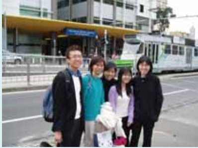
Outside the Royal Dental Hospital of Melbourne.

We went to the Royal Dental Hospital of Melbourne from 2 to 15 September 2006. Over the course of our exchange programme, we managed to observe how lessons are conducted in the dental faculty, interact with students, and observe various fields in dentistry. The Dental School in Melbourne operates on a different system compared to NUS, as they have a 5-year education system. Patient allocation and management are done by the Hospital, and the bulk of patients come from people with health concession cards as they are eligible to obtain free treatment in the dental teaching clinic.