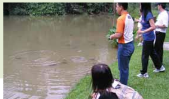
On our way down, we stopped by the pond to feed the fishes and tortoises