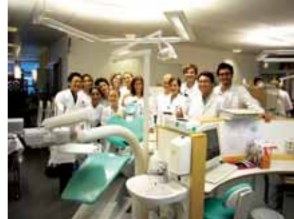
Not to forget the students who, despite their work, extended a warm welcome.