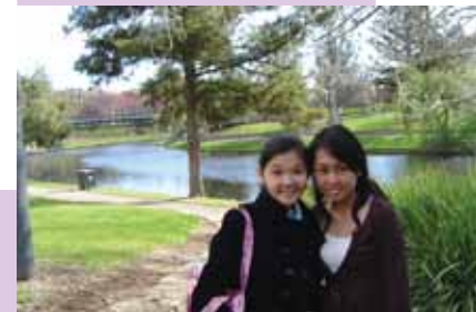
By the Torrens River with the North Terrace Campus in the background