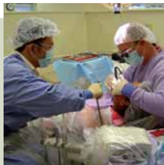
Assisting with S&P in the student clinic

The University of North Carolina at Chapel Hill is one of the most renowned dental schools in the USA. We were very fortunate and honoured to be given the opportunity to spend a week there. During our short but memorable stay, we were able to interact with the friendly staff and students, and we got to see how the DDS programme was run. We were also greatly impressed with the research and clinical excellence of their graduate programme.