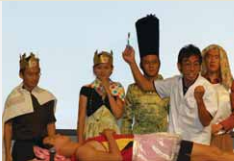
Watch me save Sleeping Beauty! - student performance at Buffet Night 2006