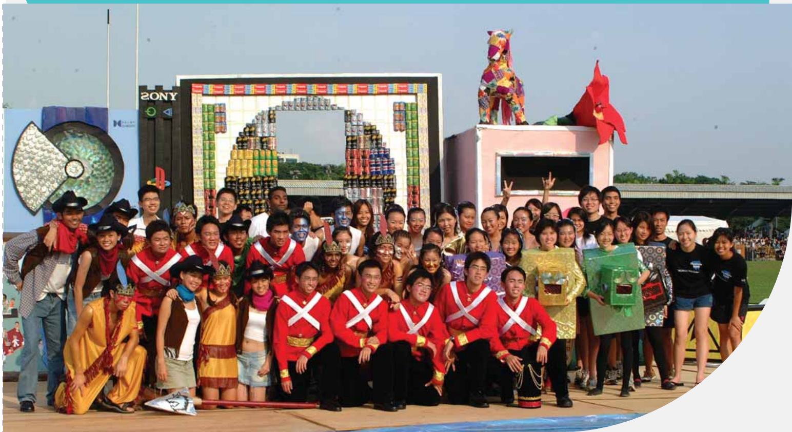
Yay! We won the Most Environmentally Friendly Float!

Freshmen Orientation 2006 kicked off with preparations for the NUS Rag Day, Sketches of the Past, Portrait of the Future . The freshmen spent nearly two weeks constructing the float which consisted mainly of a giant television screen and speakers. On 12 August 2006 - Rag Day, the freshmen gave their best performance with a dance presentation featuring graceful ballerinas, ferocious Red Indians, smart tin soldiers and cool cowboys! They did us proud with a magnificent show, executing flawless dance moves and exciting stunts that were impossible to do without countless practice and rehearsals, and of course, talent! Furthermore, our float won the Most Environmentally Friendly Float - thanks to their resourcefulness in recycling unwanted materials. Well done freshmen!