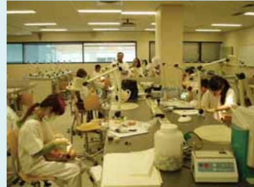
Students in Melbourne University during their Pedodontic technique class

We went to the Royal Dental Hospital of Melbourne from 2 to 15 September 2006. Over the course of our exchange programme, we managed to observe how lessons are conducted in the dental faculty, interact with students, and observe various fields in dentistry. The Dental School in Melbourne operates on a different system compared to NUS, as they have a 5-year education system. Patient allocation and management are done by the Hospital, and the bulk of patients come from people with health concession cards as they are eligible to obtain free treatment in the dental teaching clinic.