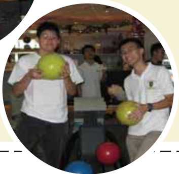
Bowling "Crystal" Ball, show me the future... am I gonna strike on the next roll??