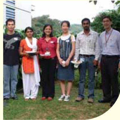
MSc postgraduate students

Introducing the incoming cohort of postgraduate students on the occasion of the Postgraduate Welcome Tea 2006 held on 16 August 2006 - MDS residents (left picture) and postgraduate research students (right picture) together with the Vice Dean of Research (extreme right).