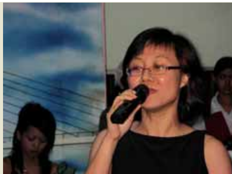
Rounds of applause for Bee Wee!