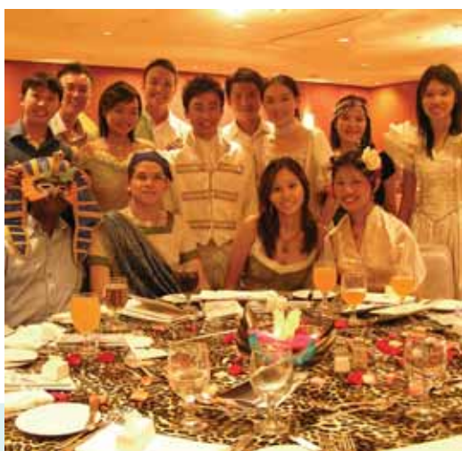
The Year ones