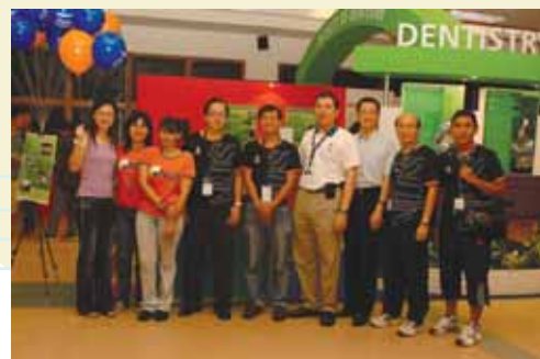
The Open House team - ever ready to share on dentistry as a career to smile about.