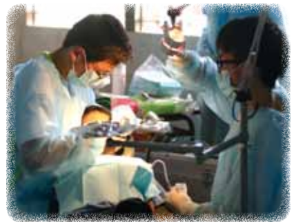
Project Sabai 2010: Faculty UG students assisting dentist during dental treatment for school children in Phnom Penh, Cambodia

Building the experiences from Project Sabai 2010, a joint effort was made to bring oral health education and free dental treatment to the less privileged children and villagers in both Sabai and Lockun, in Cambodia. Known as Project Sabai-Lokun 2011, the event took place in 10-21 December which involved clinical work and field clinics.