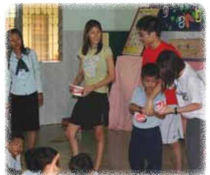
Project Sabai 2010: Dental UG students conducting oral health education for school children in Phnom Penh, Cambodia