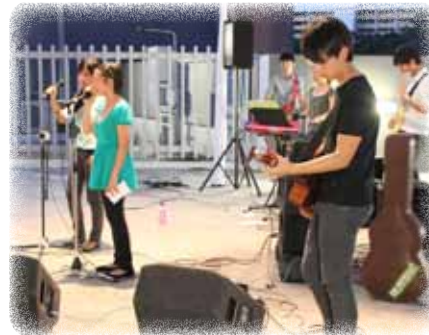
Performance by Year 2 UG students