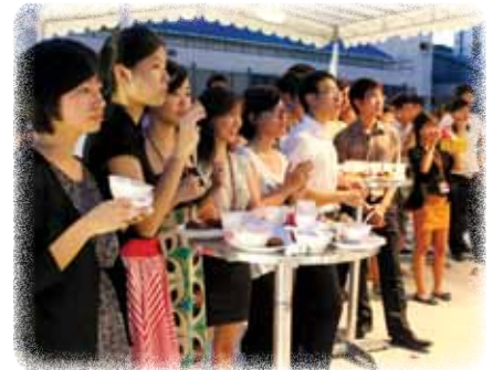
UG students at the Lounge Opening