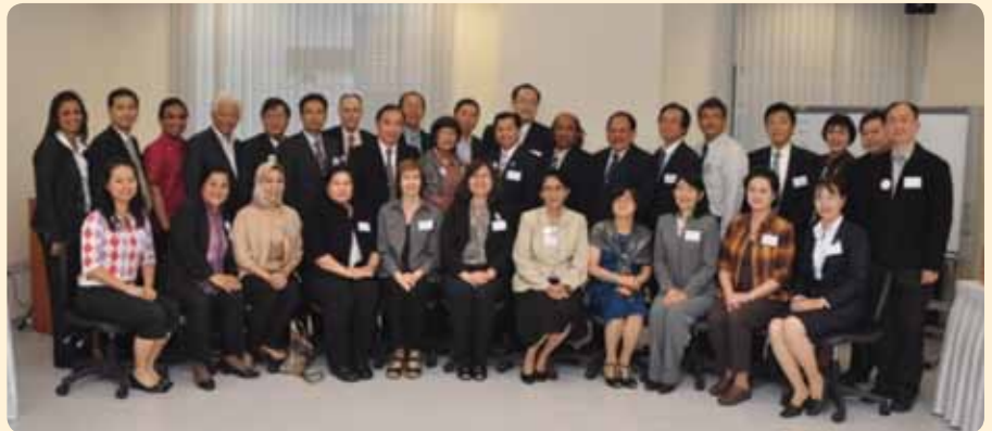
Colgate/SEAADE Dental Leadership Experience Program (DLEP)

On the pre-congress day, 28 October 2011, a string of activities were held at the Faculty of Dentistry, NUS. This included the Colgate/SEAADE Dental Leadership Experience Program (DLEP), SEAADE Council meeting, Briefing for GC Prevention Competition and Dean's Forum.