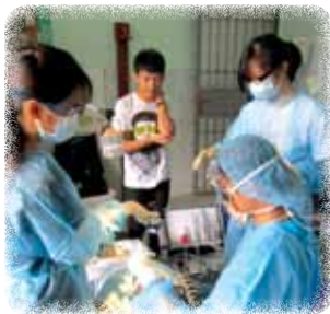
Faculty students providing assistance in dental treatment on Cambodian patient in Phnom Penh during Project Sabai-Lokun 2011

One of our main objectives for the trip was for students to experience dental work in the field, without the comforts of modern technology in the hope that they will be more appreciative of the convenience, cleanliness and accessibility of the modern clinics in the faculty. The second objective was to inspire the students to volunteer their time and effort towards the less privileged in future.