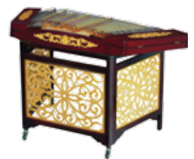
A Chinese Yang Qin

My love affair with percussion and the Chinese orchestra music began in 2003 when I joined the Raffles Institution Chinese Orchestra (RICO). At the time, the only Chinese music I was exposed to were the Jiangnan Si Zhu (traditional folk music from the Jiangnan province in China) through my grandparents. How wrong I was when I began learning the yangqin (a Chinese dulcimer) and then took up percussion. It